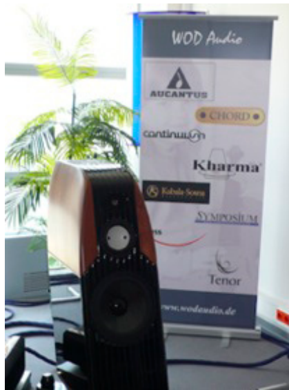
WOD Audio - Munich '08 Kharma 1E; Continuum Caliburn; Tenor Amp/ Pre-Amp/ Phono Stage; Weiss Transport/ DAC; Chord SACD; All tied together with EMOTION!!!

While it has both large-hall and individual sound room exhibits, both are in the same building along with plenty of easily accessible rest rooms, bistros, sitting areas, and live music. Even the parking is directly below with elevators taking you right to the show. Very different than the hassles of CES in Las Vegas.